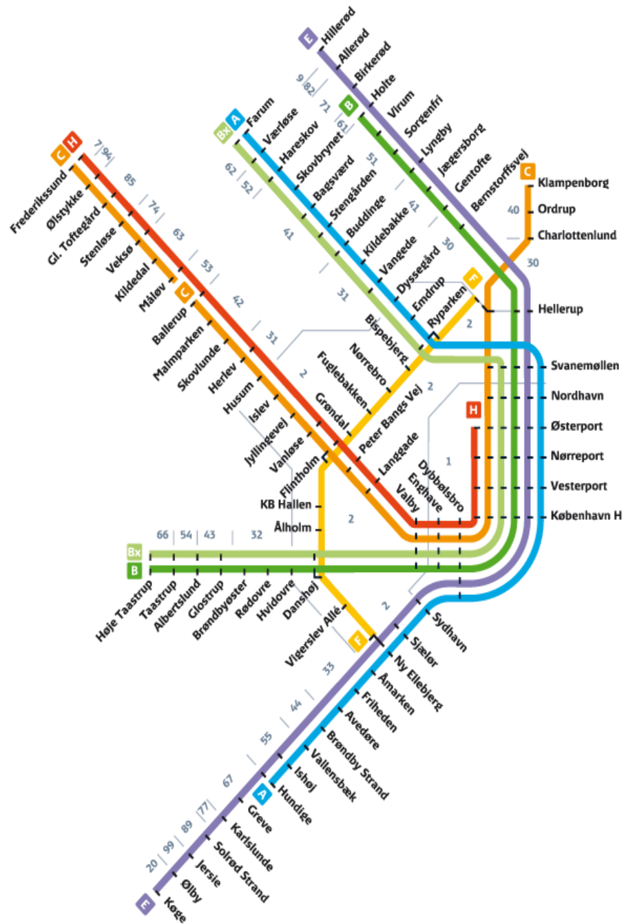
Fig. 1. The 2007 S-tog network.