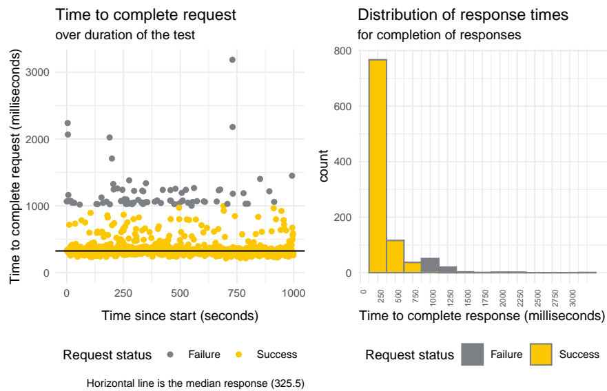
■ Figure 2 Plots of response time for GCR deployment under scenario A: elapsed time to complete requests (left); histogram with distribution of response times (right); result data file: GCR_Scenario_2_V1.