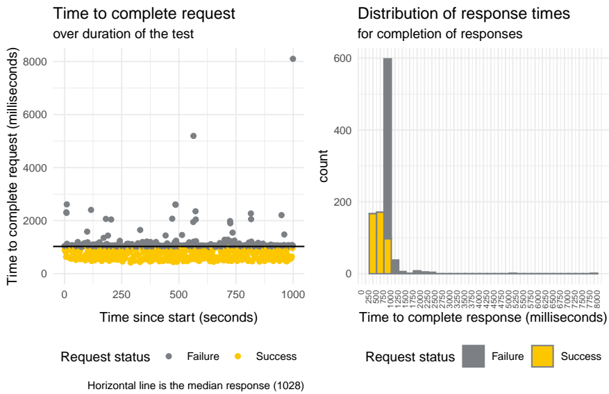
■ Figure 3 Plots of response time for AWS deployment in scenario A: elapsed time to complete requests (left); histogram with distribution of response times (right); result data file: AWS_Scenario_2_V1.