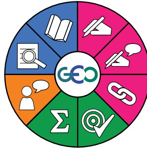
■ Figure 1 GEO label based on SSW sensor metadata, rendered by the GCR deployment, with all eight facets fulfilled; source URL: https://glbservice-nvrpuhxwyq-ew.a.run.app/glbservice/api/v1/svg?metadata=https://raw.githubusercontent.com/nuest/GEO-label-java/master/server/src/test/resources/ssno/ERC_all_facies_available_ip68smartsensor.rdf .