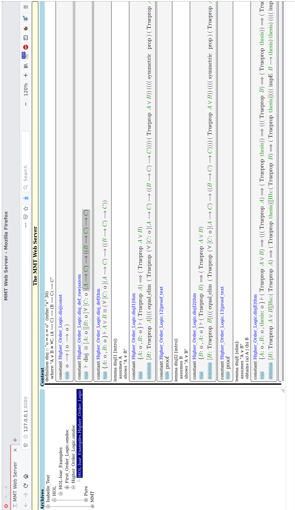
Figure 2 Disjunction in Higher-Order Logic: definitions, theorems and proof terms.