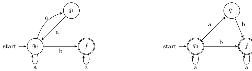
■ Figure 1 Finitely ambiguous and 2-ambiguous Büchi automata.

The complexity of basic regular operations on languages represented by unambiguous finite automata was investigated in [5], and tight upper bounds on state complexity of intersection, concatenation and many other operations on languages represented by unambiguous automata were established. It is well-known that the tight bound on the state complexity of the complementation of nondeterministic automata is 2^n . In [5], it was shown that the complement of the language accepted by an n -state unambiguous automaton is accepted by an unambiguous automaton with 2^{0.79n + \log n} states.