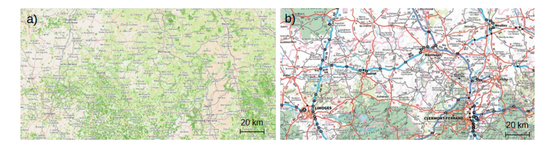
Figure 3 An area mapped at a regional scale to illustrate the absence of hierarchy: a) OSM: very few entities are salient, and no structure stands out. b) IGN map with more hierarchy.

were organised. In a similar way memorising the position of an object is easier, and the user may experience less disorientation as the landmarks are easily identifiable and memorable between scales. Finally, we could hypothesise that cluttered maps are less accessible to the general public and require a higher level of expertise. Indeed, an expert may dedicate more time to reading the map, already knows some reading keys etc. For instance, geological maps are often cluttered, but still useful for experts.