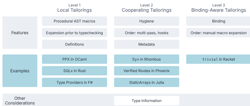
■ Figure 1 Three levels of support for type tailoring.