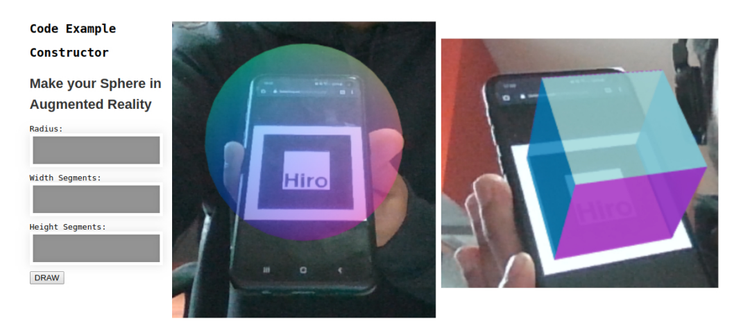
Figure 2 Example of the interaction in the prototype under construction.

Figure 1 Proposed Scheme to generate AR-LR.