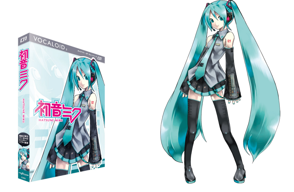
Figure 2 Singing synthesis software Hatsune Miku with a cute synthesized voice and an illustration of a cartoon girl.