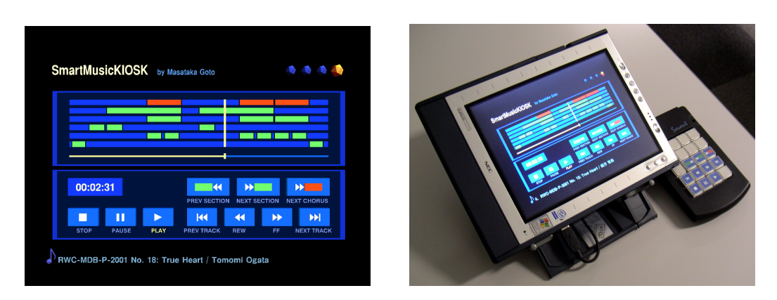
Figure 4 SmartMusicKIOSK screen display. This is a music listening station with a chorus-search function. The lower window presents the playback operation buttons and the upper window provides a visual representation of a song's contents. A user can actively listen to various parts of a song while moving back and forth as desired on the visualized song structure (the "music map" in the upper window).