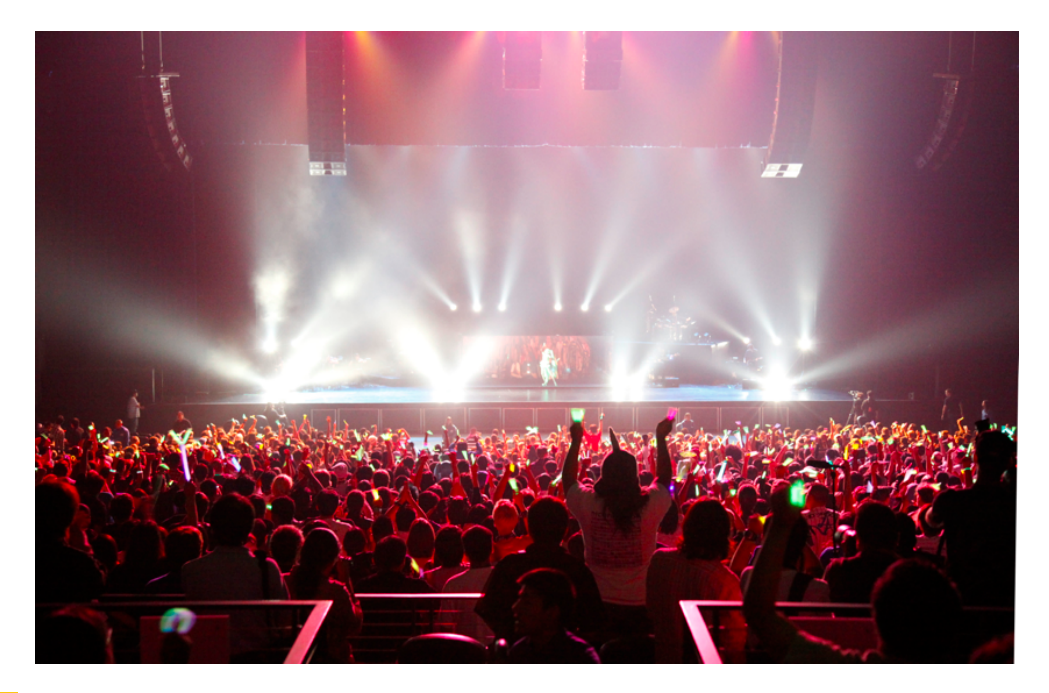
Figure 3 Live concert by Hatsune Miku at MIKUNOPOLIS 2011 [13] in Los Angeles, USA on July 2nd, 2011.

the vocals or accompaniment) are used as material to be mixed together and combined as if they were parts of the same song from the beginning. By referring to the musical memory already in the mind of the listener, these mash-ups are able to raise the level of complexity acceptable for enjoyment while retaining popularity. In the days when there were no electronic instruments, it was only possible to create music based on units of single notes (individual instrumental notes) on a musical score, but advances in technology have made it possible to produce music using musical fragments of several bars (one phrase) as units or loop material. Mash-ups are musical productions using whole songs as units or material, making it easier to achieve complex audio signals that would be inconceivable when creating a song from scratch. From the viewpoint of listeners, on the other hand, when the songs used as material to be mixed together are already in the memory, they can enjoy songs that would normally be too complex to enjoy.