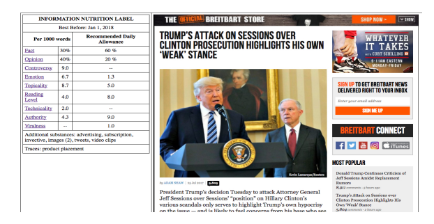
Figure 1 Mockup of the envisaged information nutrition label.