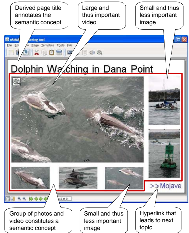
Figure 2: Example of semantics derivation for page-based multimedia presentation

Figure 2 shows an example page of a page-based multimedia presentation demonstrating the use of such semantics derivation rules in xSMART . The page depicts photos and videos from a dolphin watching tour some friends did in Dana Point, Southern California. As the figure shows, the user expresses that the video is a more important media asset in the presentation than the smaller images. By placing the media assets together on one page, they are identified as semantic concept. This semantic concept is annotated with the text Dolphin Watching in Dana Point , as the user expresses this text to be the title of the page by placing it at the top in a sufficiently large font.