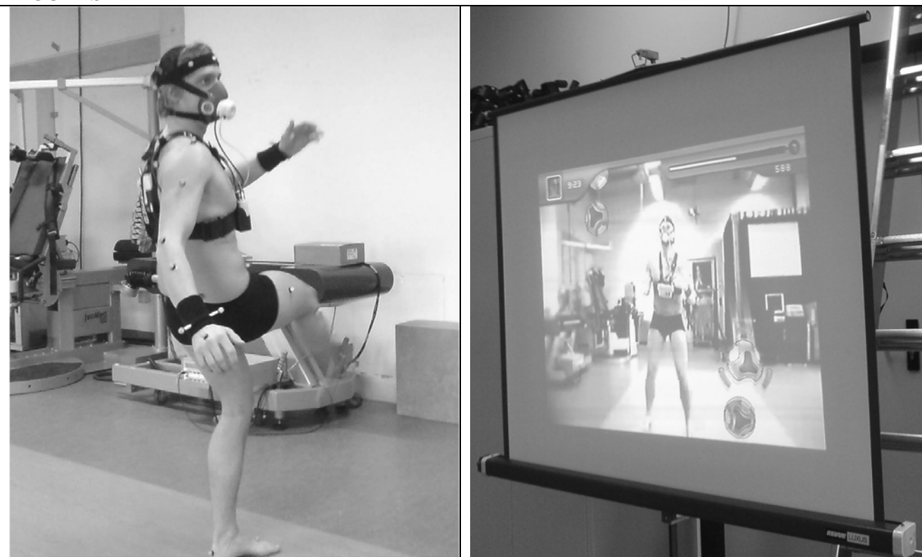
Figure 1: Subject on the left side is playing EyeToy Kinetic waterfall game in front of the projection of himself within the augmented reality world shown on the right.