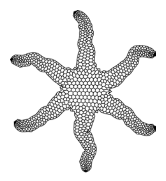
FIGURE 2. A close-up of the final form from Figure 1.